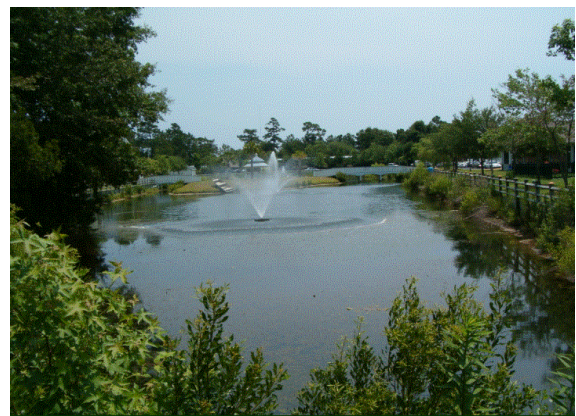
Figures 1 and 2: Stormwater ponds used for irrigation in Myrtle Beach, and recreation/aesthetics in Charleston, SC.

The research summarized in this report found that some ponds protect receiving waters from pollution and protect communities from flooding during storms, while other studies found that ponds were polluted, can impact receiving waters, and are not controlling stormwater runoff as they were designed and permitted. Because stormwater ponds have diverse designs and characteristics, determining a common denominator for pond performance is difficult. These structural designs (Appendix A) and other factors such as age, location within the watershed, and linkages with other ponds play an important, albeit not well understood, role in their functioning and performance. A variety of research on stormwater ponds addresses their functionality, water and sediment quality, and surface and groundwater impacts. If not properly maintained, ponds can accumulate sediment and debris and have slope and/or outlet failures, resulting in high sediment and pollutant loadings to receiving waters. When sediment is removed from ponds as part of routine maintenance, contaminated sediments could require disposal at certified landfills.