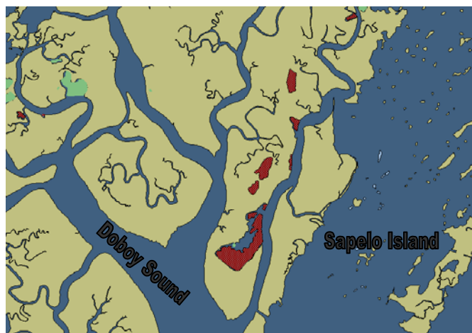
Figure 1. Back-barrier islands sampled in McIntosh County, GA are indicated by shading.

We conducted a series of field observations within and near the Georgia Coastal Ecosystems Long Term Ecological Research (GCE LTER) site at Sapelo Island, Georgia, during the summer and fall of 2002 (Fig 1). The back-barrier islands were selected on the basis of accessibility, minimal impact from residential or agricultural development, natural origin (as opposed to dredge spoil) and size. Back-barrier islands were identified using an ESRI ArcView v.3.2 map database provided by the Georgia Dept. of Natural Resources